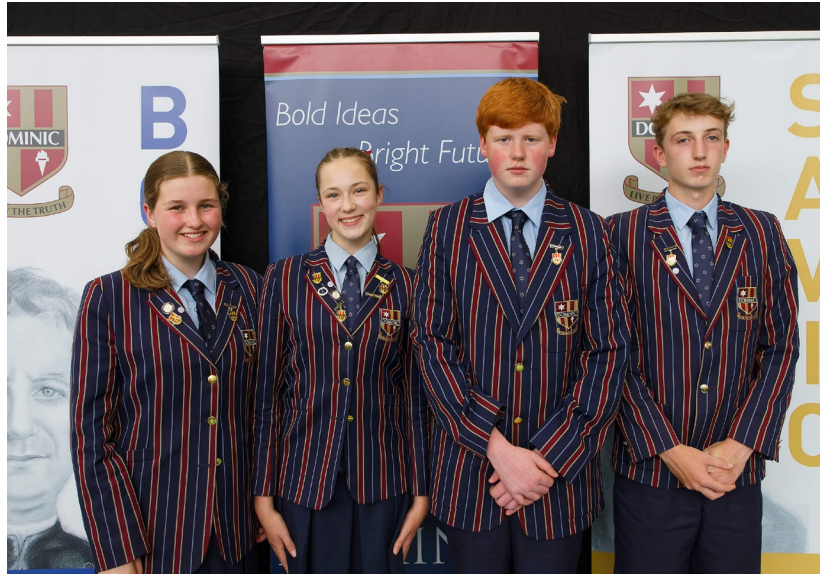
2024 College Captains