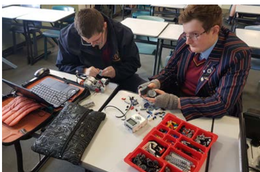
Year 8 students pulling apart a computer