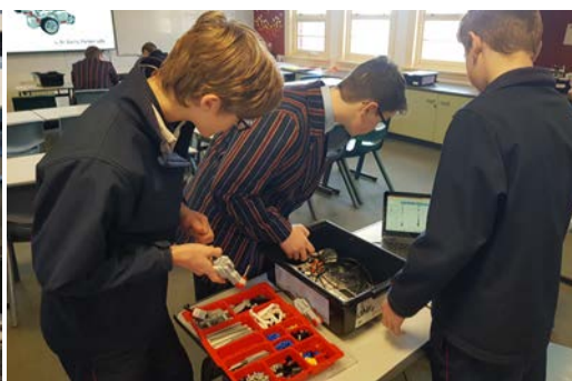
Students watching a test run of a sumo robot